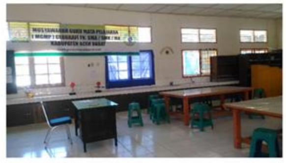
Fig. 2. Representation of Actual situation of laboratory work in majority of senior high school in west Aceh, Meulaboh

the picture shows actual situation from sample we taken. this showing not sufficient for sort of secondary school laboratory. although the minimal standard of laboratory can be fulfilled, it can not guarantee that knowedge tranfer to student is happen properly. allen and white (1999) explained that some competencies need to be met were 1) critical thinking, analyse, solve the problem, 2) find, evaluate, and using appropriate knowledge resources, 3) cooperate teams and small groups, 4) oral, written skill effectively, 5) use content knowledge and intellectual skill to be a contious learner. Gokhal (1995) explained that cooperative learning is also the best way to reinforce strudent critical thinking in practical knowledge leading to the success of education process. and cooperative learning can be done by laboratory work when it is supported by good quality and sufficient equipment.